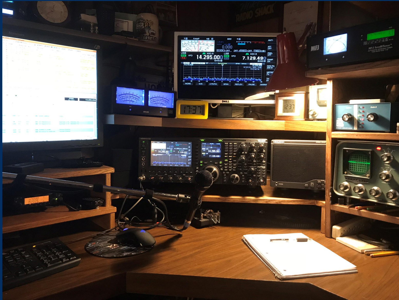
TS-990s MFJ 998 tuner