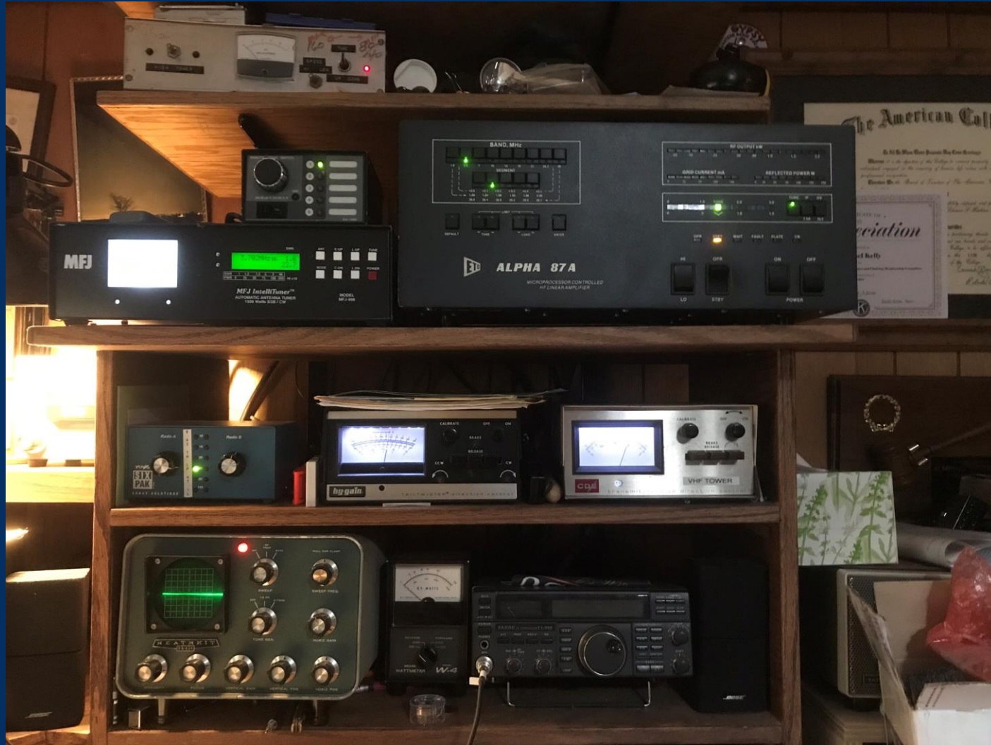
Alpha 87A, FT-840, SB-610 station monitor