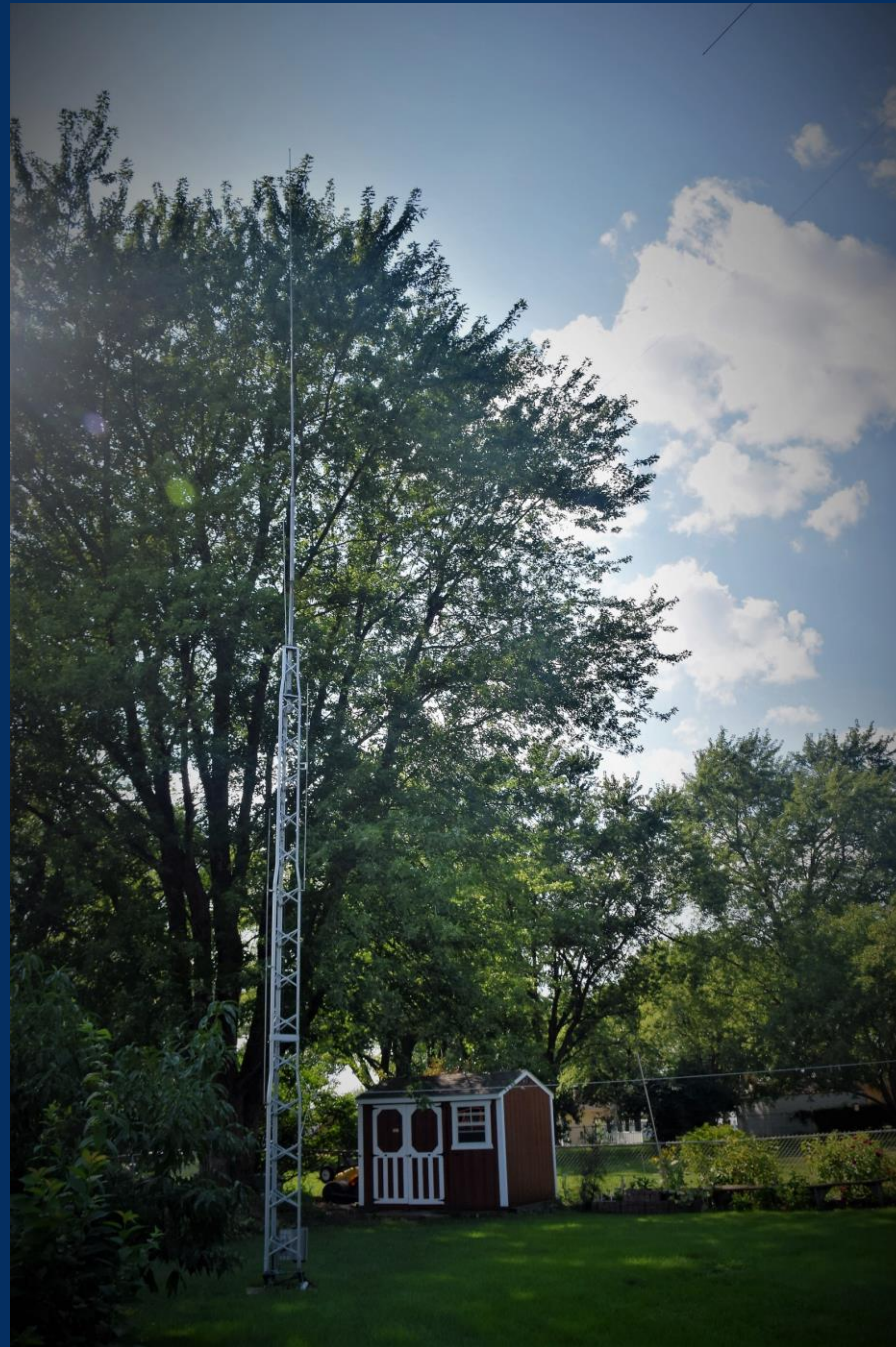
Hy Gain High Tower 18Ht with 30 radials